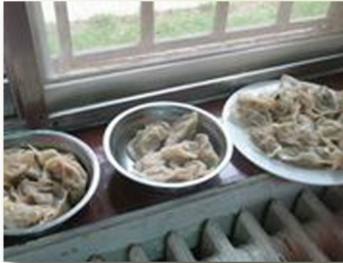
Dumplings and ice cream—our children’s staple foods for the trip (dumplings hand-made by our students themselves).