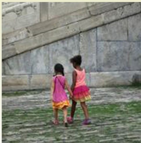
Strolling hand-in-hand through the Forbidden City.

The program consisted of two weeks of instruction held on the grounds of the Shang Li Foreign Language School, located in the Fragrant Hills area on the outskirts of Beijing. The kids from Austin, 10 in all, were ages 5 to 10 years and were divided into a younger and an older group. On weekday mornings, they attended classes that featured play-based language instruction and after lunch, they met up with local children for playtime. The children also got to spend a day in the homes of