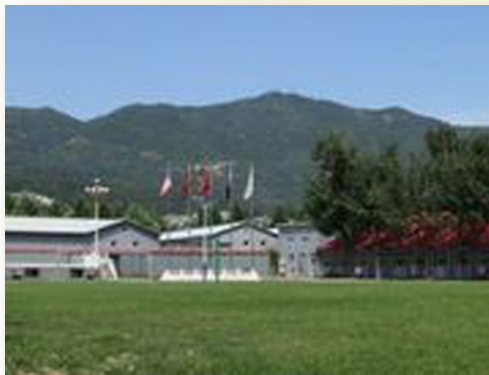
A beautiful sunny day on the grounds of the ShangLi Foreign Language School.

their Chinese hosts, getting to help make and eat a typical family meal. Meanwhile, parents were offered beginning instruction in Mandarin in the mornings and cut loose in the afternoons to see the sites or otherwise experience Beijing until everyone met up back at the school for dinner.