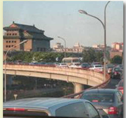
Experiencing the infamous Beijing traffic on the way to dinner.

a little slow on the uptake to this point.] To make sure the usual summer trip to visit extended family could still happen, we routed the connecting flight through Seattle. Thus, the whole Beijing excursion would be sandwiched between some state-side R&R, Pacific Northwest style.